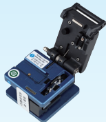
Optical fiber cleaver 光纤割刀